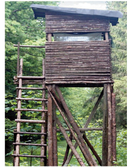
Figure 2. Typical hunting stand/ high seat in Germany

nently paralyzed as a result of their accident. 5,17 Regarding the age of hunters involved in accidents there is evidence, that younger hunters are more likely to be injured in general. 18 As Terry et al. described in 2010 25-34 year old hunters have a higher injury rate although only 17% of hunters in the USA are in this age group and nearly half of hunters are aged between 35 and 54 years. 7 Regarding the German LBG database on hunting accidents we see according to Crockett et al. 11 a higher rate of injuries due to falls than to firearm accidents. Falls occur much more often, but they are not as lethal as firearm injuries.